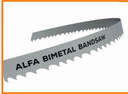
Bi-Metal Saw Blade