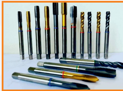
Carbide / HSS Tap