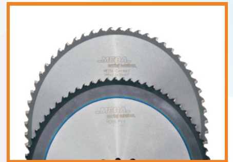
Carbide Circular Saw Blade