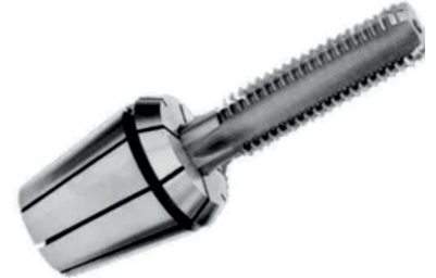
HSS / Carbide All Tap