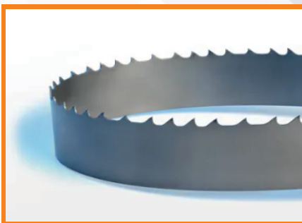
Bi-Metal Band Saw Blade