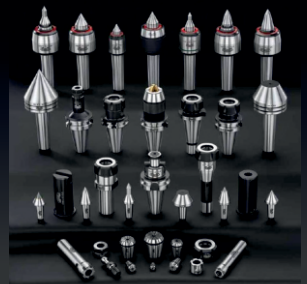
Revolving Centers & CNC Tool Holders