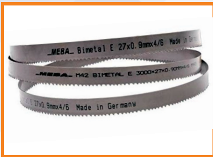
Band Saw Blade