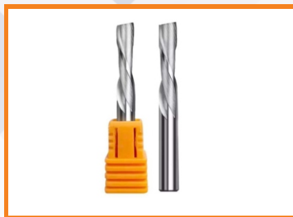
Carbide Step Drill