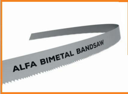
Bi-Metal Saw Blade