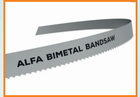
Bi-Metal Saw Blade