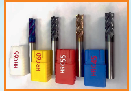
Carbide End Mill