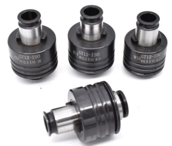
Collets Tapping Chuck