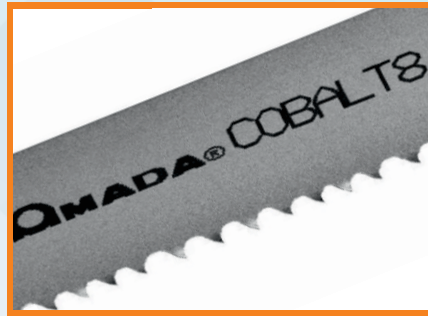
Bimetal Band Saw Blade