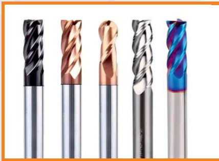
Carbide End Mill