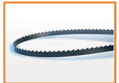
Carbon Band Saw Blade