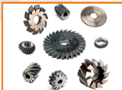
HSS Drill Bit