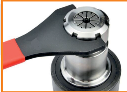
ER Spanner & Nut