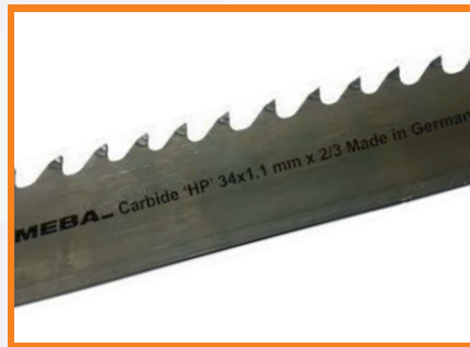
Bimetal Band Saw Blade