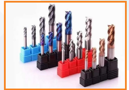
Carbide End Mill