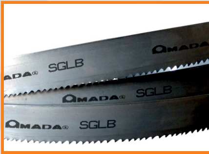
SGLB Saw Blade