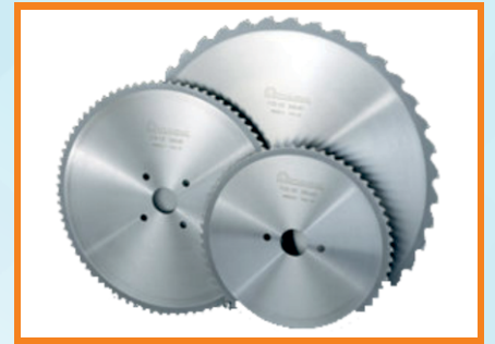
Carbide Circular Saw Blade