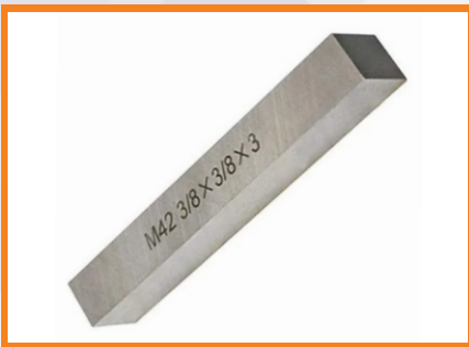
HSS Tool Bit